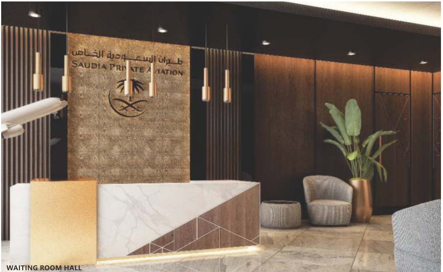
WAITING ROOM HALL

Among the services that SPA looks at extending to Kuwait is managing private owned aircraft if their owners agree to have them based in Jeddah or Riyadh where SPA has FBOs.